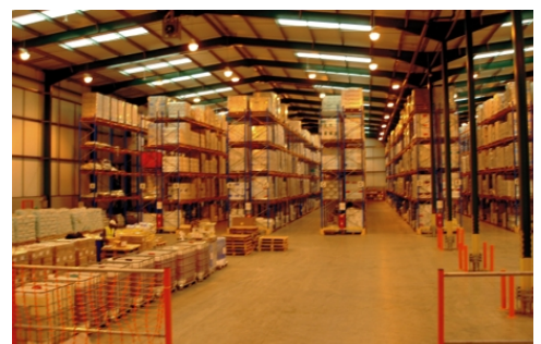
UAP's impressive Alconbury store

Unfortunately on both occasions we neglected to acknowledge the source of the pictures so, we would like to put the record straight now and say a big thank you to UAP for the use of their pictures.