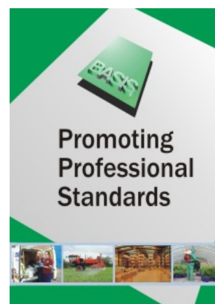
The new BASIS booklet

The new booklet outlines the aims and objectives of BASIS and puts these into the global context of a rising world population with its associated increased demand for food, amenity and public health. It also describes the activities of BASIS in providing examinations and qualifications, pesticide store audits, Professional Registers and Continuing Professional Development schemes and so on. If you've not seen the booklet then you can download a copy here .