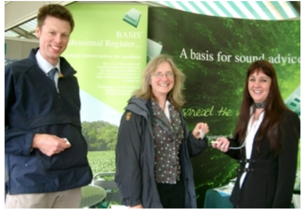
Queues to register for CPD points often formed